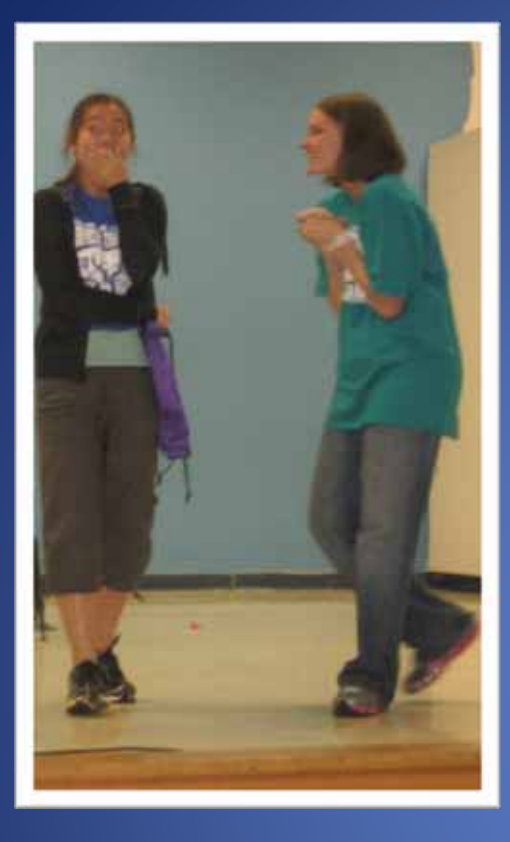
May is the 2011 SARIS Group <u>National</u> Poster Contest Winner!!