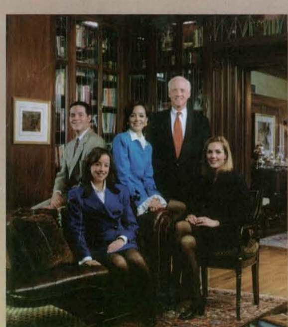
Governor Frank Keating and family (L-R): Chip, Carrie, Cathy, Frank and Kelly

Arriving From The North: On I-35, 10 miles south of the Oklahoma/Kansas border near Blackwell, OK. Free coffee. Arriving From The Northeast: Two locations: (1) On I-44, Will Rogers Turnpike, east of Miami. Free coffee, gift shop. (2) On I-44, Will Rogers Turnpike, south of Vinita. Free coffee. In Tulsa: At I-44 & 161st East Avenue. (under construction). Arriving From The East: Two locations: (1) On US-412, Cherokee Turnpike, 13 miles west of Oklahoma/Arkansas border, near Kansas, OK. Free coffee. (2) On I-35, three miles north of the Oklahoma/Texas border near Thackerville, OK. Free coffee. Arriving From The Southwest: On I-44, H.E. Bailey Turnpike, at the Elmer Graham Concession Plaza, Gift Shop. Arriving From The West: On I-40, nine miles east of Oklahoma/Texas border near Erick, OK. Free coffee. In OKC Area: Three locations: (1) In the State Capitol at N.E. 23rd & Lincoln Blvd. (2) At I-35 & E. 122nd. (3) I-40/Air Depot exit at S.E. 29th. Free coffee. Gift shop.