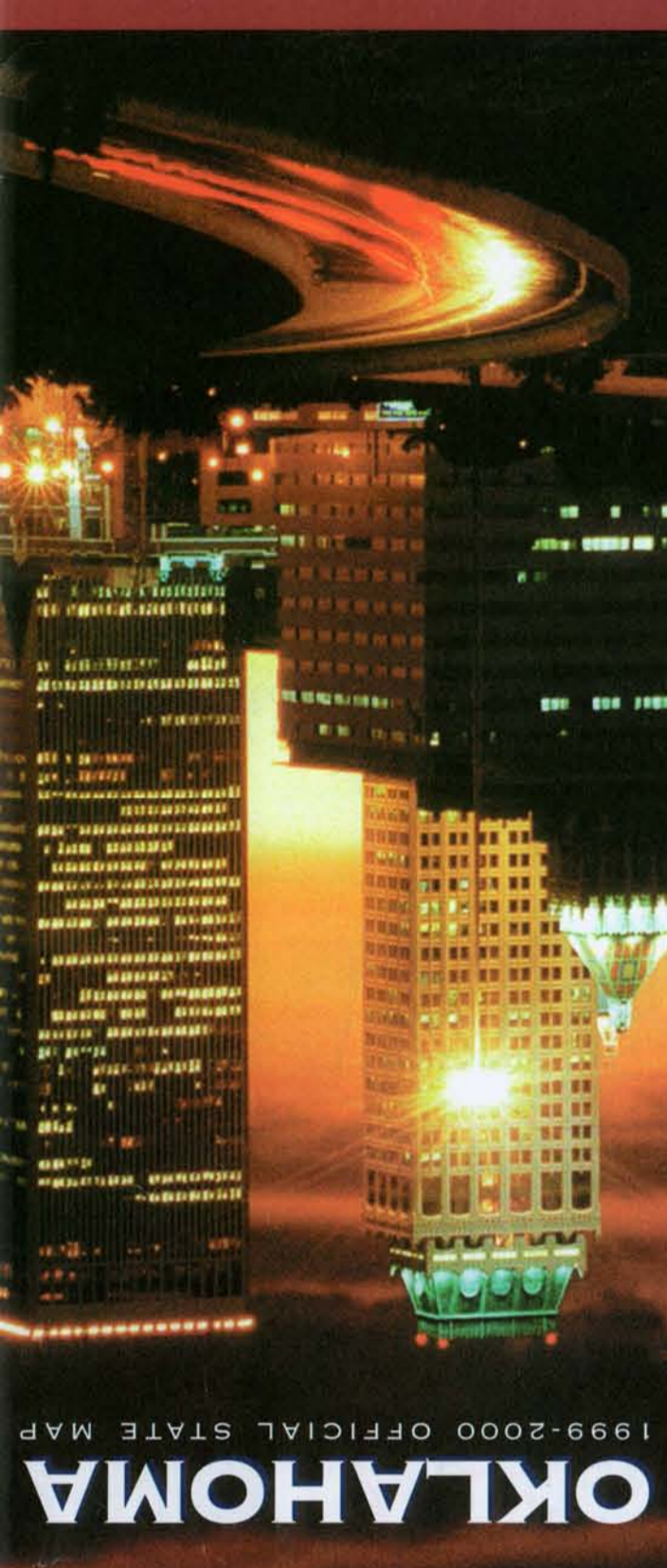
OKLAHOMA 1999-2000 OFFICIAL STATE MAP