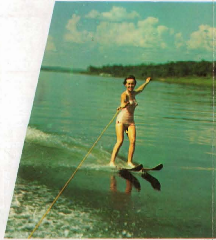
FUN TRAILS LEAD TO A THOUSAND MILES OF LAKES. TULSA IS FAMED AS THE OIL CAPITAL OF THE WORLD.