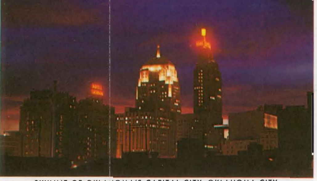
SKYLINE OF OKLAHOMA'S CAPITAL CITY, OKLAHOMA CITY.