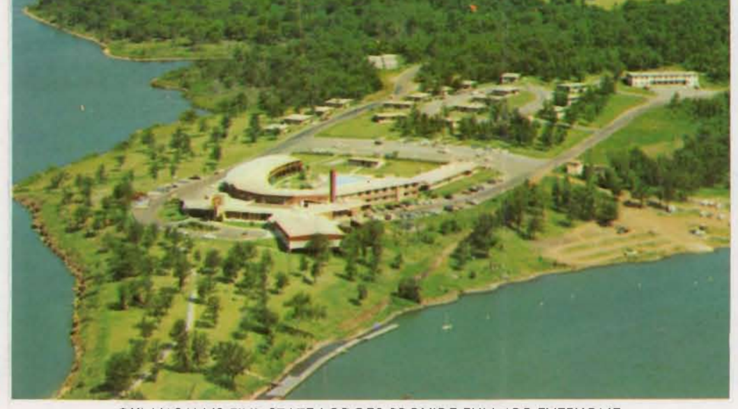
OKLAHOMA'S FIVE STATE LODGES PROVIDE FUN FOR EVERYONE.