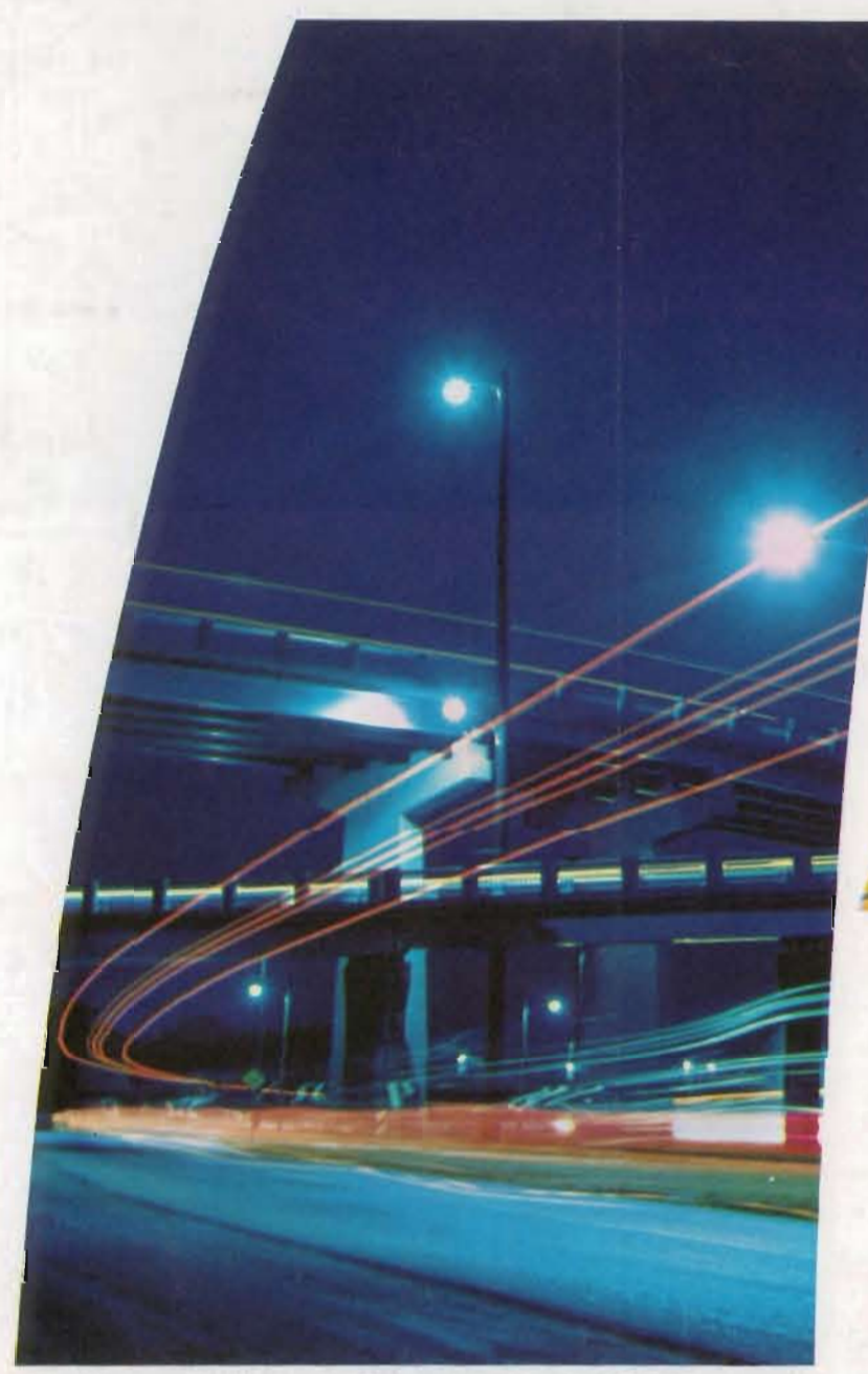
OKLAHOMA STANDS AT THE CROSSROADS OF THE NATION.