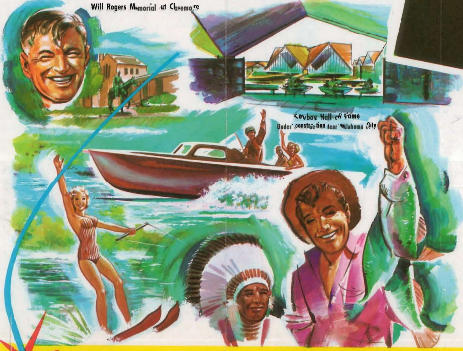
Will Rogers Memorial at Claremore