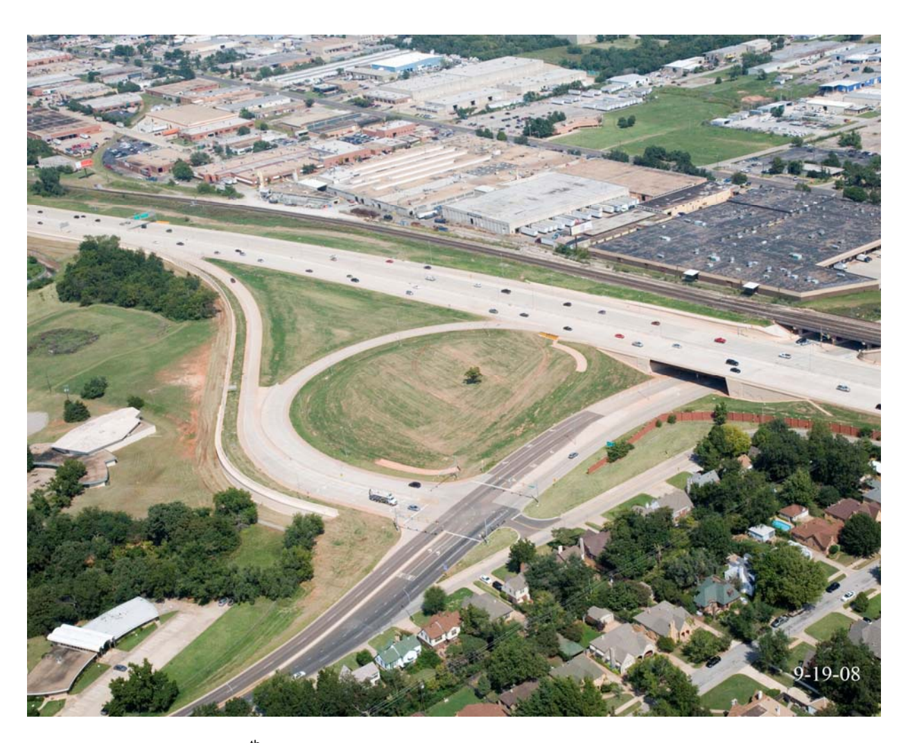
The I-235 at N.W. 36<sup>th</sup> St. Interchange project in Oklahoma City, completed in September 2008, was honored with the regional America's Transportation Award Monday. The award recognized ODOT and its partners for the top-tier construction, early completion, saving of taxpayer money and adding innovative public art on the $27 million project northwest of the state Capitol.