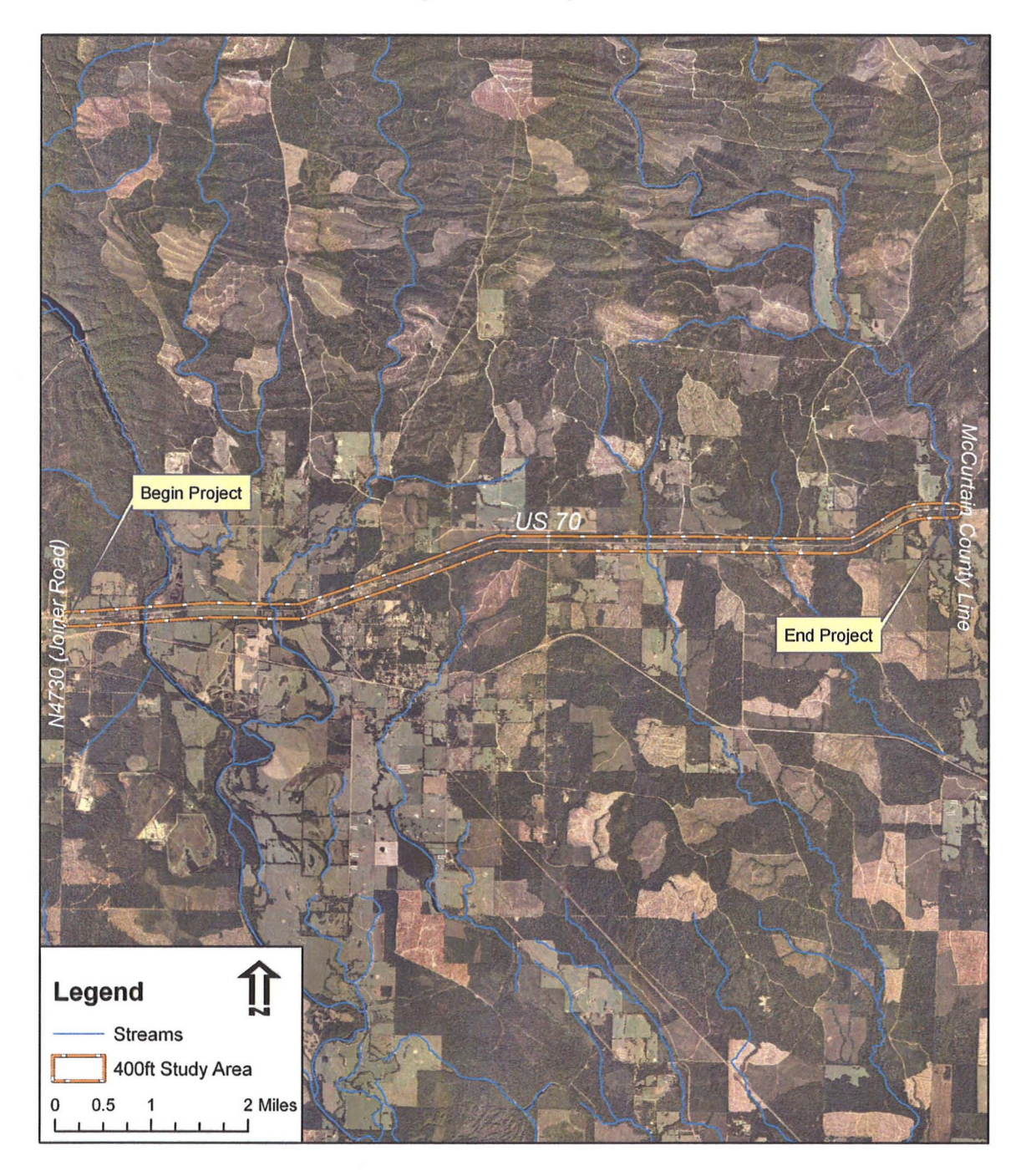
Figure 2. Study Area