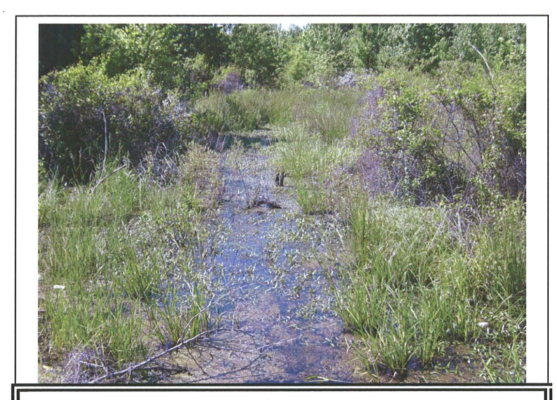
Photograph #1- View of Site 1 (Crossing 6) on north side of U.S. 70 (May 5, 2004).