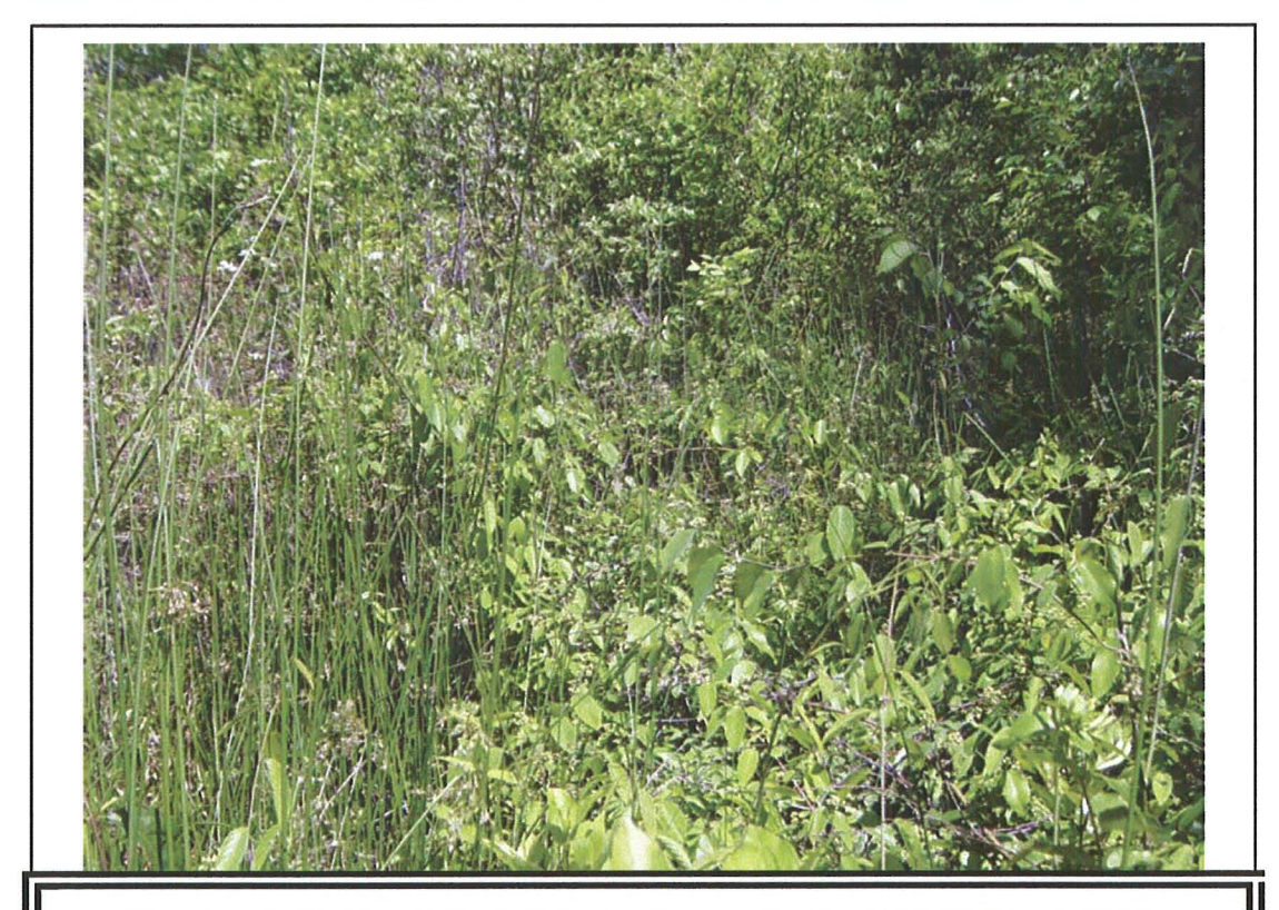
Photograph #2- View of Site 2 (Crossing 6) on south side of U.S. 70 (May 5, 2004).