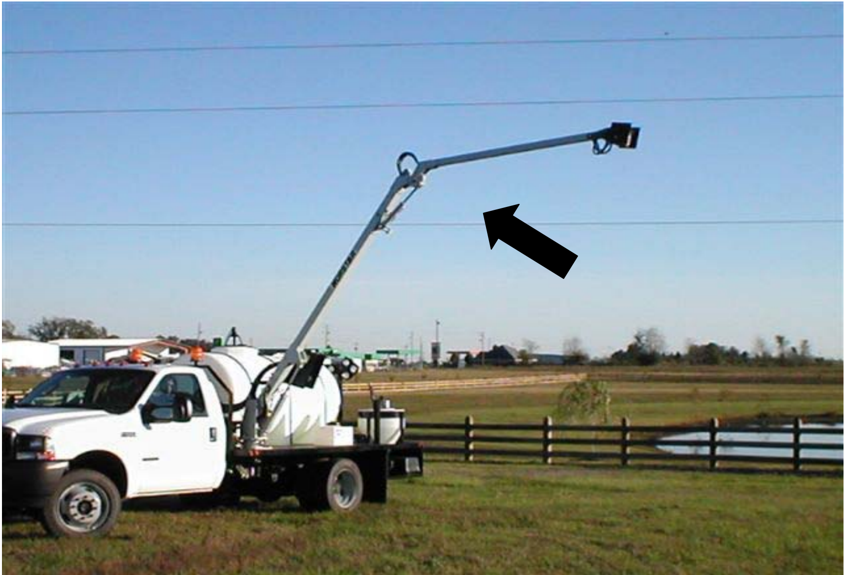
Figure 1. Long Shot boom mounted on 1 ton F550 with 750 gal. tank.